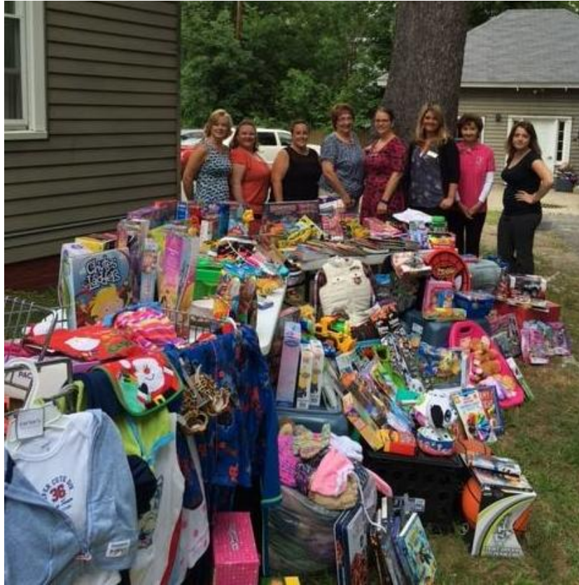
The Kennebec Valley Chapter of Credit Unions Christmas in July drop-off to benefit the Christmas Program.