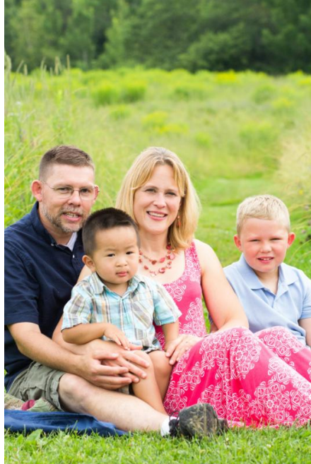
The Whittaker family recently worked with The Maine Children's Home's adoption team.

Please reach out to Lindsay and the adoption team if you think adoption might be a goal for your family. It's never too early to start planning and researching. We are pleased to share that we have a new lending library in the suite of offices in the Parks Building on campus.