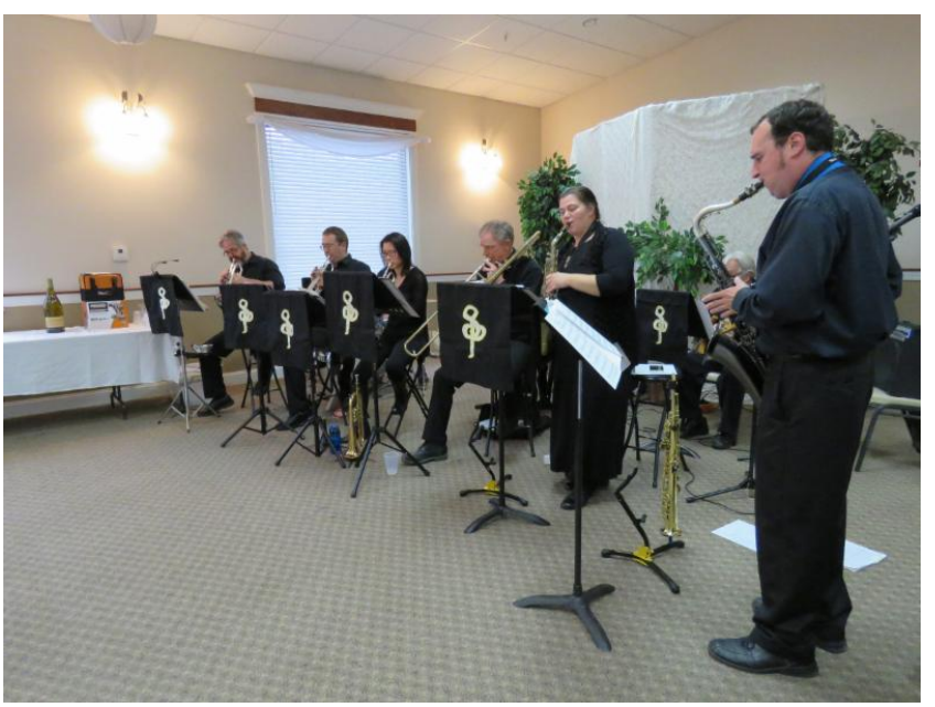
The Sunday Project Jazz Band