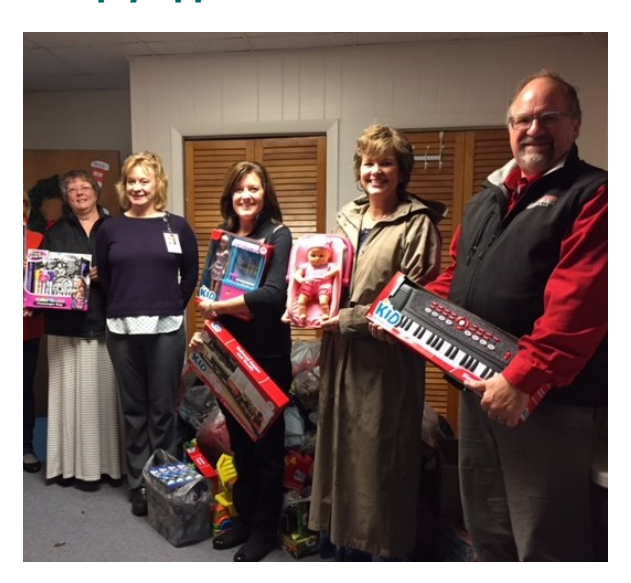
Central Maine Motors Auto Group dropping off their toy donations to Maine Children's Home